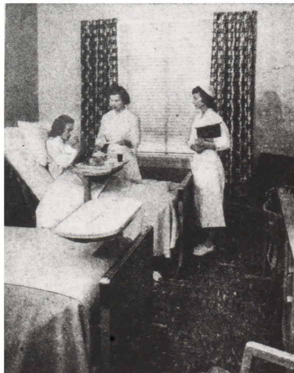
PATIENTS' ROOMS ATTRACTIVELY FURNISHED Sick Admitted to Institution Carefully Selected

Health scientists are asking questions and hope to find the answers.