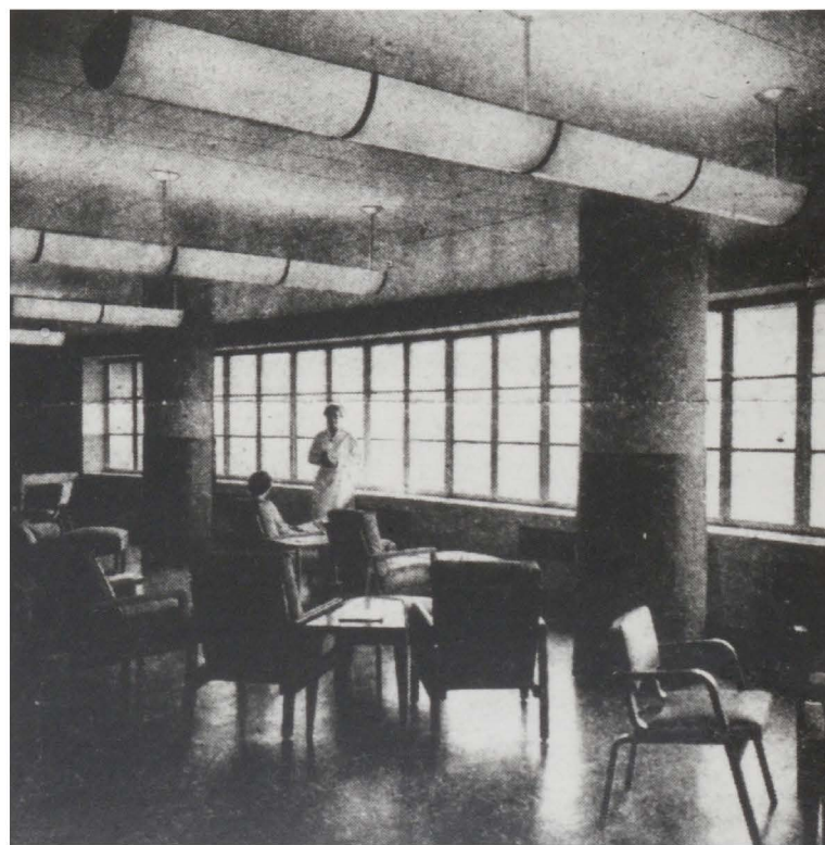
SOLARIUM FOR PATIENTS EMPHASIZES CENTER'S NEATNESS Private Physicians to Be Informed of Sick's Progress

The remaining two-thirds comprise the research and service facilities. The emphasis is on laboratories and the huge building can accommodate as many as