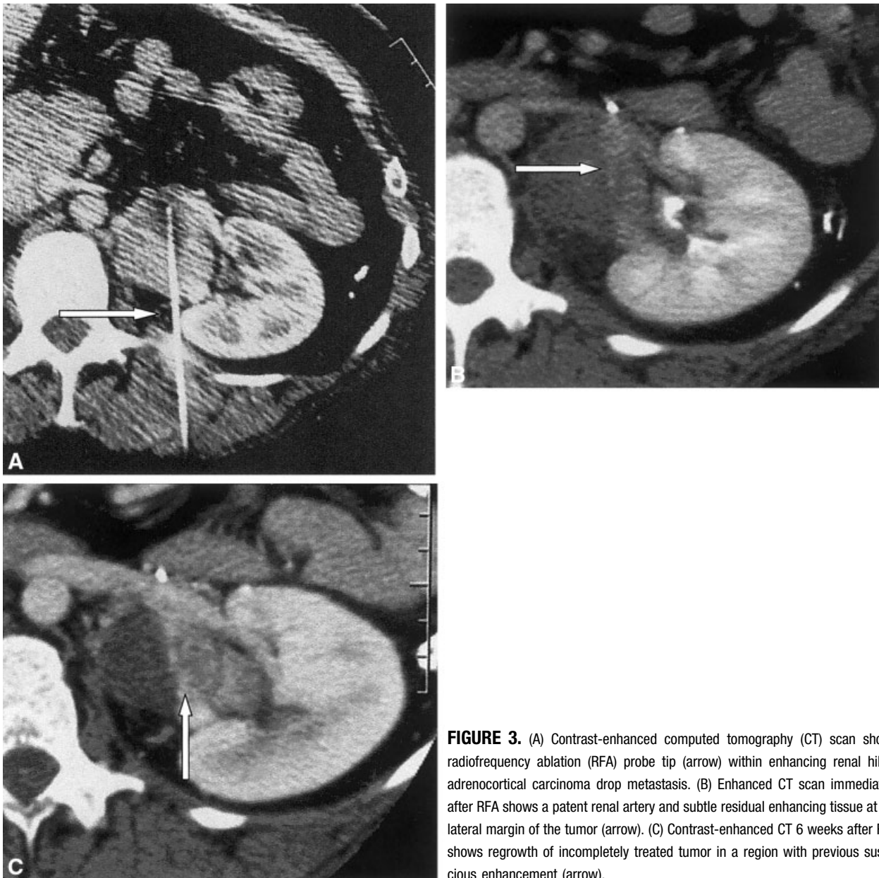
FIGURE 3. (A) Contrast-enhanced computed tomography (CT) scan shows radiofrequency ablation (RFA) probe tip (arrow) within enhancing renal hilum adrenocortical carcinoma drop metastasis. (B) Enhanced CT scan immediately after RFA shows a patent renal artery and subtle residual enhancing tissue at the lateral margin of the tumor (arrow). (C) Contrast-enhanced CT 6 weeks after RFA shows regrowth of incompletely treated tumor in a region with previous suspicious enhancement (arrow).

pre-RFA tumors and treated areas shrunk over time (Figs. 1, 2, 4; Table 1).