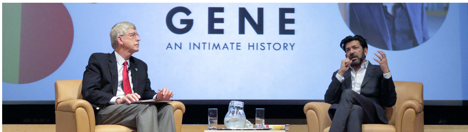
Dr. Siddhartha Mukherjee (right), Pulitzer Prize-winning author of “Emperor of All Maladies”, visits the National Institutes of Health April 17 to give a presentation based on his new book “The Gene: An Intimate History.” He led the audience through a history of genetic medicine, including the early findings and assumptions of genetics’ founding fathers, how eugenics emerged as an area of study and its devastating costs to society and how genetic information is used in present day practice. Following his lecture, Dr. Francis Collins, director of the NIH, and Mukherjee discussed the important issues and ethical questions around the use of germline manipulation technologies such as gene editing and what the opportunities and consequences of such technology can be for the human race.