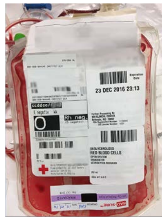
Previously frozen blood, ready to be transfused into a patient at the NIH Clinical Center.

The transfusions supported the patient while she received more definitive treatment for her severe aplastic anemia. The patient's clinical status soon improved dramatically, and she has since stopped requiring regular transfusions.