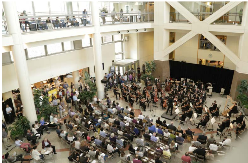
The National Symphony Orchestra filled the NIH Clinical Center atrium with music from Mozart, Zart, Ravel, Elgá, Rodrigo and Debussy on Sept. 22. The event marks the 11th time musicians from the National Symphony Orchestra have performed at the NIH. The performances are a part of their Sound Health initiative, which brings orchestral music to area hospitals and medical centers.