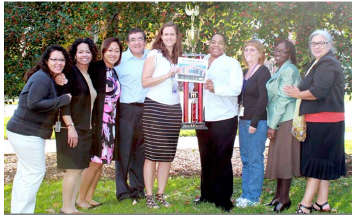
Members of the Clinical Center Office of Patient Recruitment were awarded the MatchMaestro award from ResearchMatch, an online recruitment tool. ResearchMatch is a not-for-profit registry run by Vanderbilt University.

Roughly 67,000 volunteers nationwide have created a profile on the site. A volunteer who is inter-