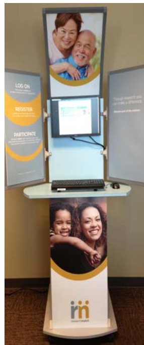
A ResearchMatch kiosk has been placed at the NIH visitor's center.

ResearchMatch is part of the NIH Clinical and Translational Science Awards program. Only research sites that are affiliated with the awards program can extend invitations to potential research studies. All studies listed on the website have been approved by an institutional review board.