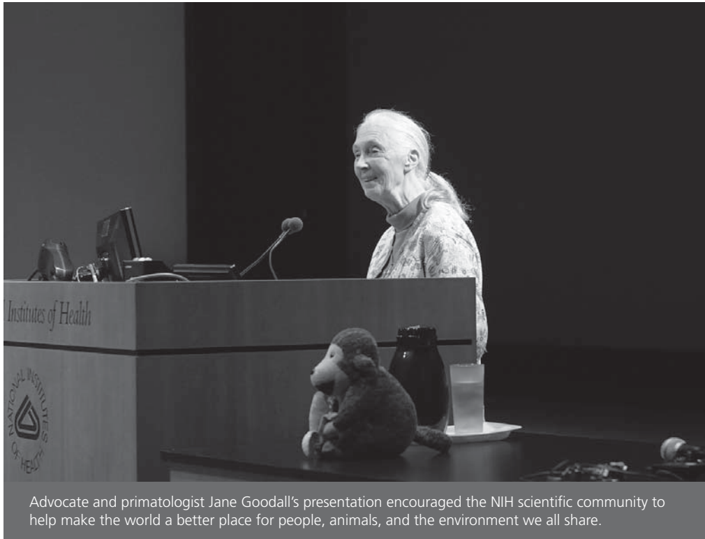
Advocate and primatologist Jane Goodall's presentation encouraged the NIH scientific community to help make the world a better place for people, animals, and the environment we all share.